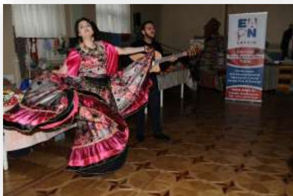
A musical greeting from the Roma group during the handicraft exhibition

Participants of the meeting and exhibition shared experience in work with people from the risk groups and good practices how to motivate them to study and to become entrepreneurs.