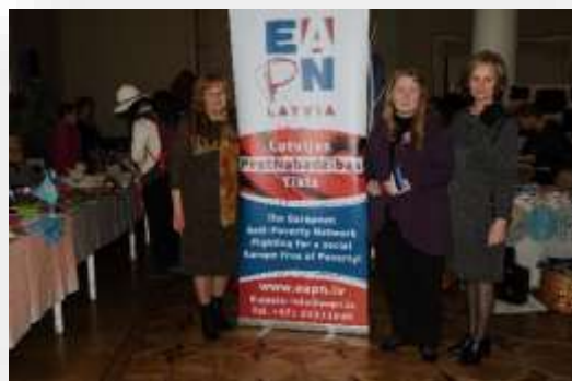
Baltic colleagues in Riga in April 2016

MITRA members told about objectives and outcomes of TAP project to representatives of NGOs, small enterprises from the Baltic sea region and decision makers, discussed with them possibilities for people in risk of poverty to start own small business, to find contacts and cooperate with handicrafts masters from Estonia, Latvia, Lithuania, Poland, Finland, Sweden, Norway and Kaliningrad district (Russia).