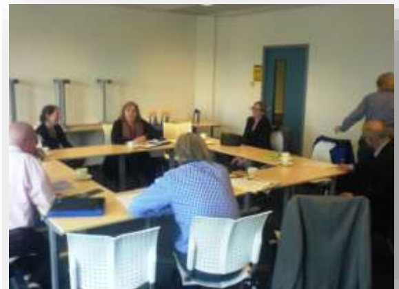
Meeting about the O3 workshop

Of course, the household, the family and the neighborhood are important and sometimes crucial, but the feeling of the person has to be that wishes, possibilities and ideas will be taken seriously. That is the start, also of such a training as 'life management'.