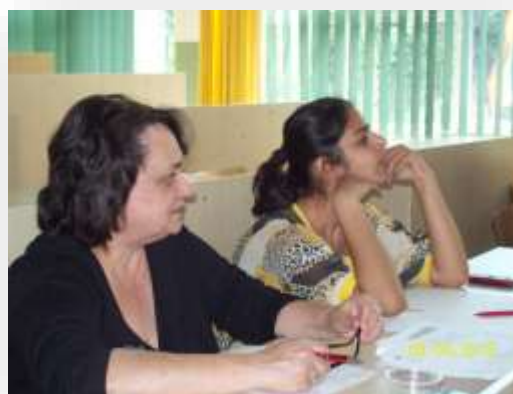
Learners in the O3 workshop

The TAP workshop for decision-makers in the social protection system is currently being prepared. The planned structure is as follows: in the first meeting, the learners will discuss and provide solutions – according to the Romanian legislation and practice – for problem situations shared by the Polish, Italian, Spanish, Dutch and Estonian partners. In the second meeting, the participants will review the suggestions received from the partners for solving the Romanian case. These solutions will be weighed carefully to decide whether they are similar to what is being done in Romania within the current legal provisions, or whether the current legal provisions prevent such solutions, whether it would be a good idea to amend the law or whether the solutions would call for more radical restructuring of the social security system.