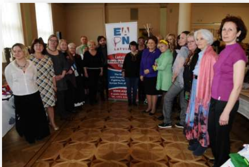
Participants of European Anti-Poverty Network in Baltic sea region

Participants of the meeting and exhibition exchanged the best practices in creative work, organization of health care, family businesses, marketing and trainings.