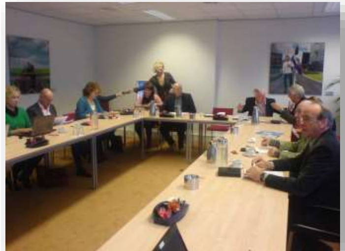
Experts' meeting – O4 workshop

Cases about poverty and social exclusion in other countries gave the experts the best opportunity to reflect on them from different points of view. And every expert could bring in his or her own solutions, giving a good mix at the end to report to our project partners.