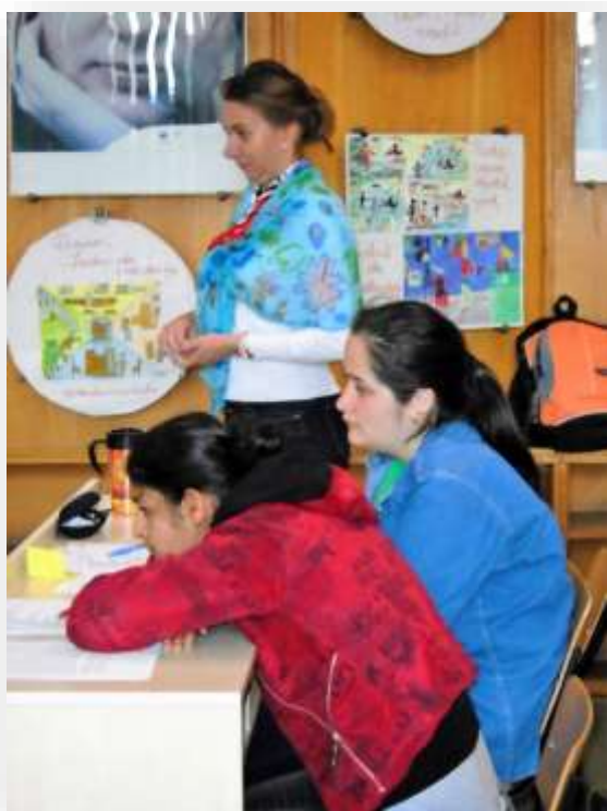
Learners and trainer in the O3 workshop

From the participants' self-assessment, it has resulted that 9 out of the 10 have made highly significant progress in improving their entrepreneurial skills.