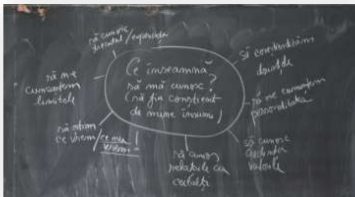
Who am I?

The targeted learning outcomes for this the 30-hour training programme were: increased self-awareness and self-confidence, enhanced knowledge of career opportunities and the world of work, and improved planning skills. The major topics dealt were: Who Am I? ; My Place in the World of Work ; Where am I headed and how do I get there? ; My Toolkit . In a highly collaborative environment, the participants learnt from both the trainers, and each other. Most of the activities proved fully accessible for all learners; for a few, however, the trainers had to provide some more support than anticipated.