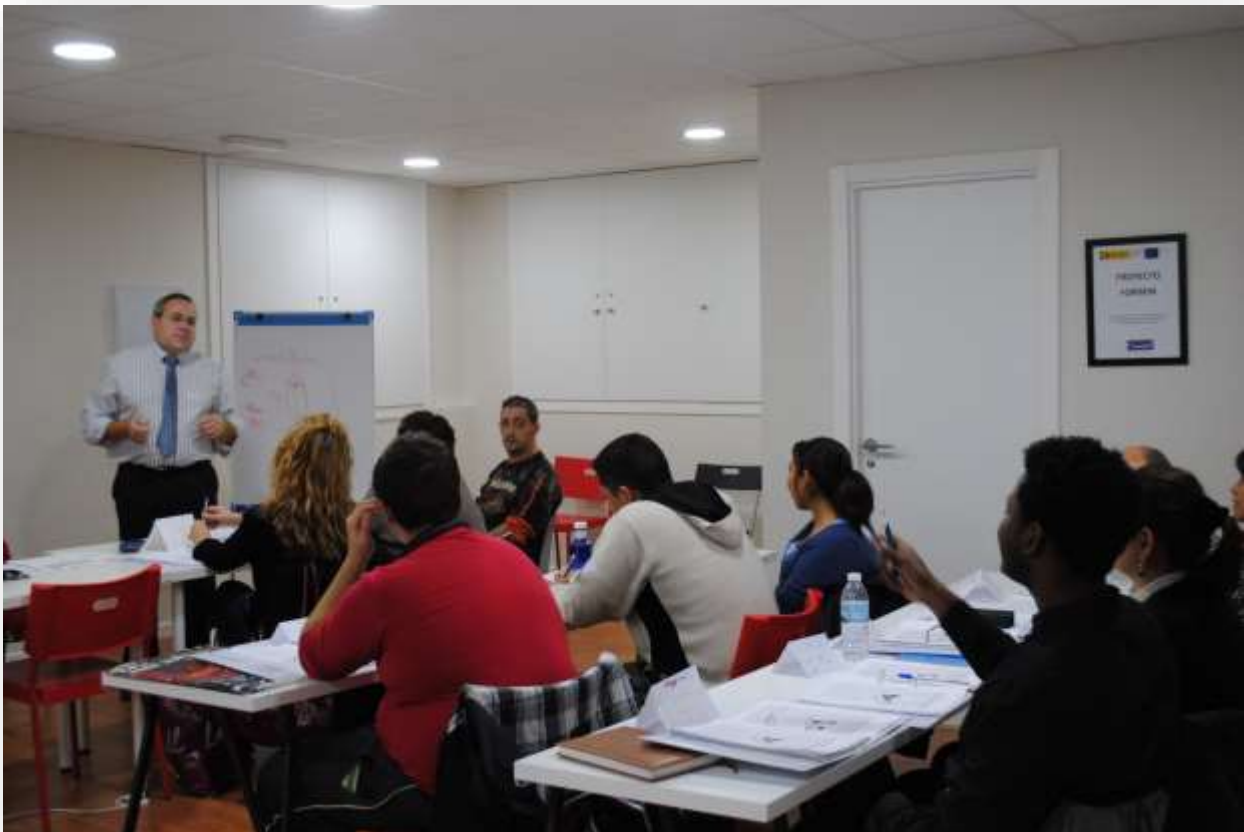
Trainer and learners in the O3 workshop

The main goal of the TAP project is poverty prevention through the development and implementation of educational tools. Thus, throughout the sessions the cases exposed by the countries which are members of the project were analysed. We haven't had many difficulties developing and solving the cases. Some of them would easily be transferable to Spain.